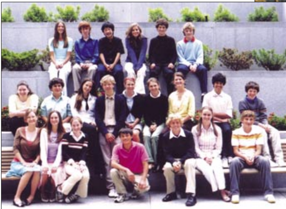
Class of 2005